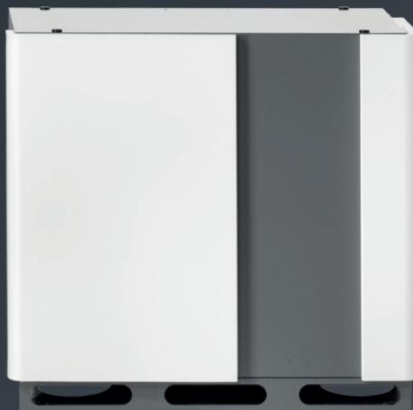
S10 SE BATTERY COMPARTMENT